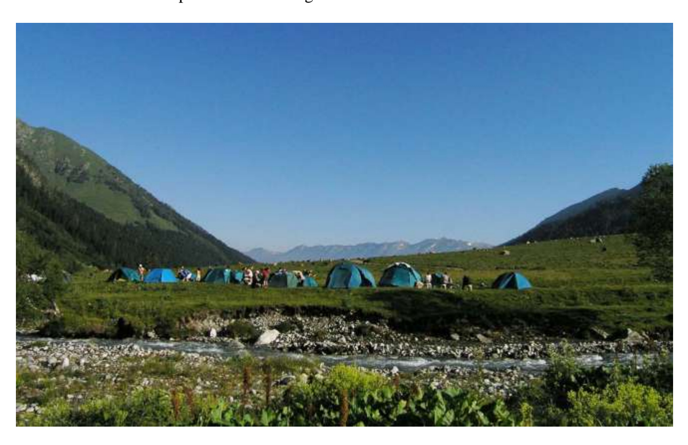
Day 3. Transfer to Sophia valley. Luggage transported with the car. Trek over Irkiz pass 3020m to visit nice Sophia lakes. Overnight in tents 1900m.