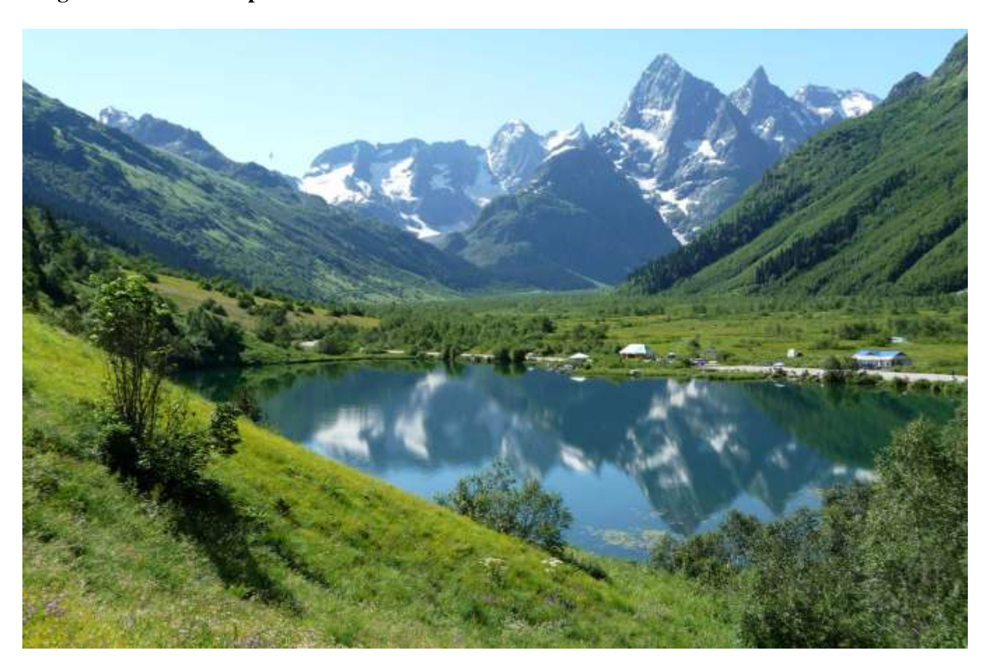
Day 1. Arrival to Mineralnie Vody flight from Moscow. Transfer 200km to Arhyz village 1450m.. Installation refuge Arhyz, 2-3-4 bed rooms.