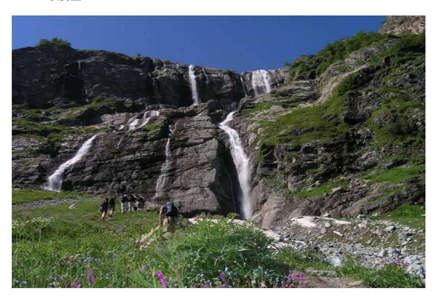
Day 5. Trek over Ozerny pass 2610m to Maruha valley. Luggage transported on a car. Overnight in tents 1750m.