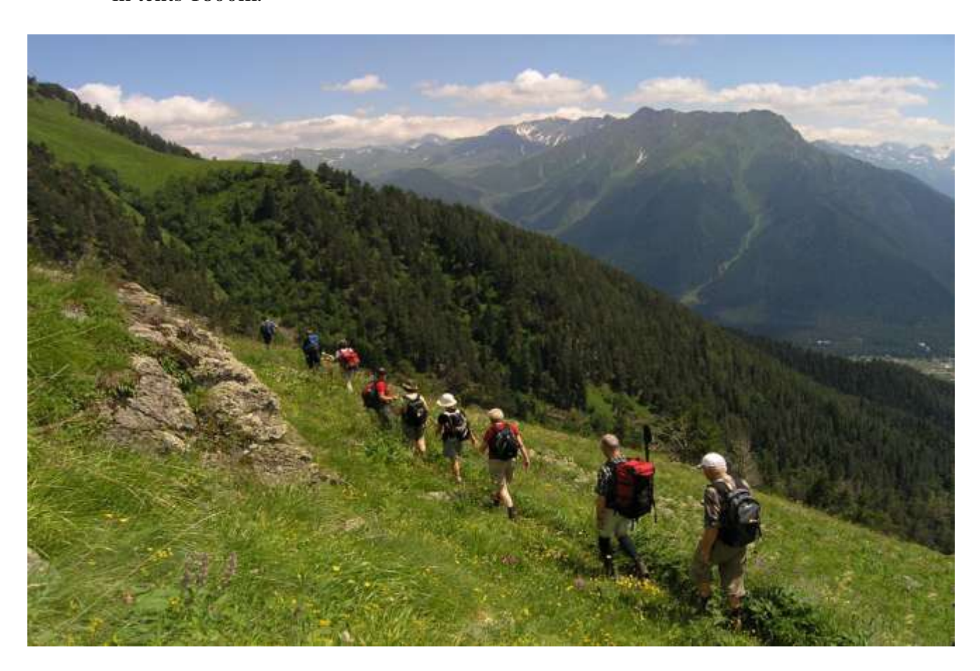
Day 8. Transfer to Alibek Camp 1960m. Trek to Alibek waterfall, Tur Lake. Hostel Alibek.