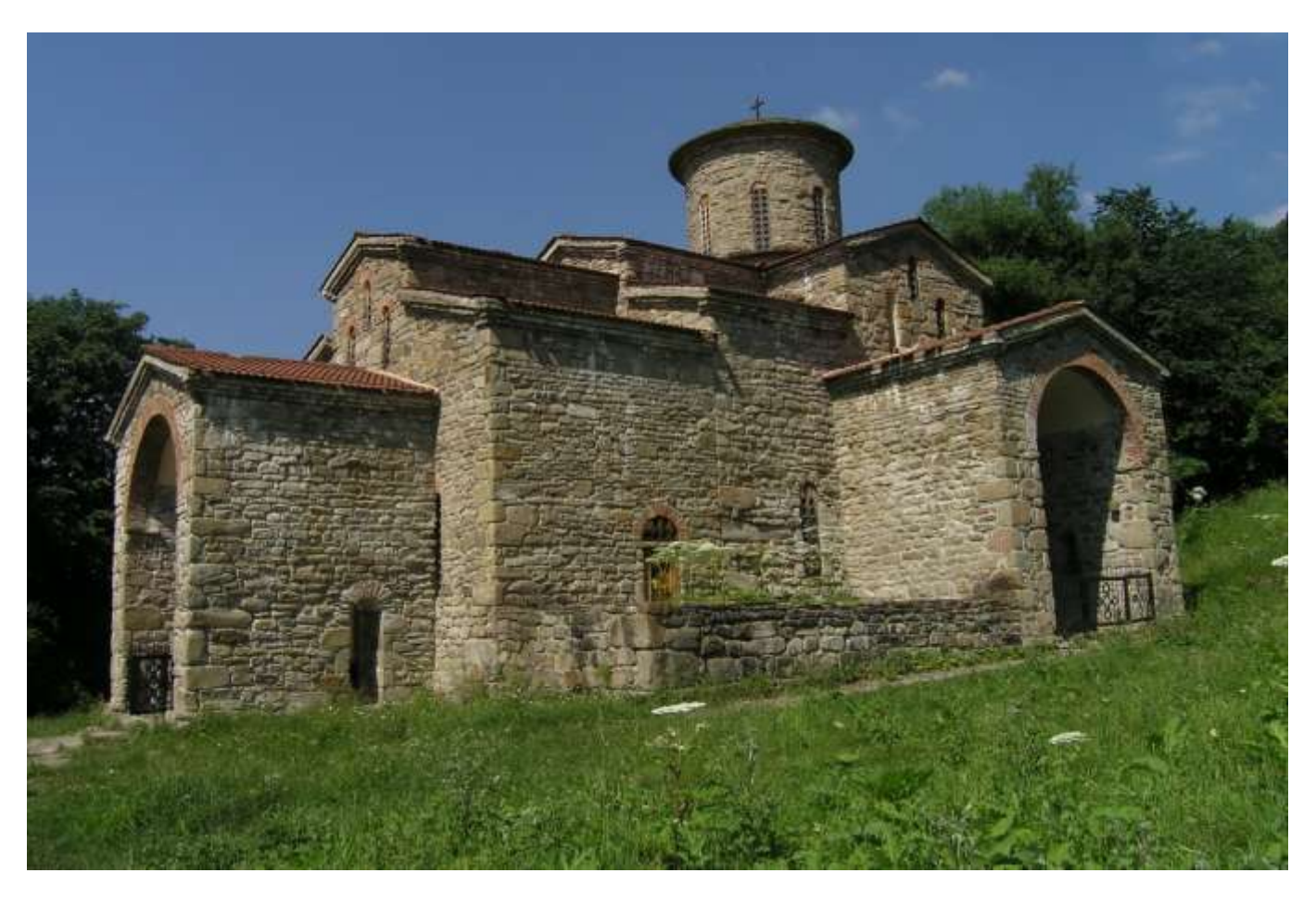
Day 2. Day at the Arhyz village. Trek to the Panoramic top 2230m. Night in Arhyz refuge.